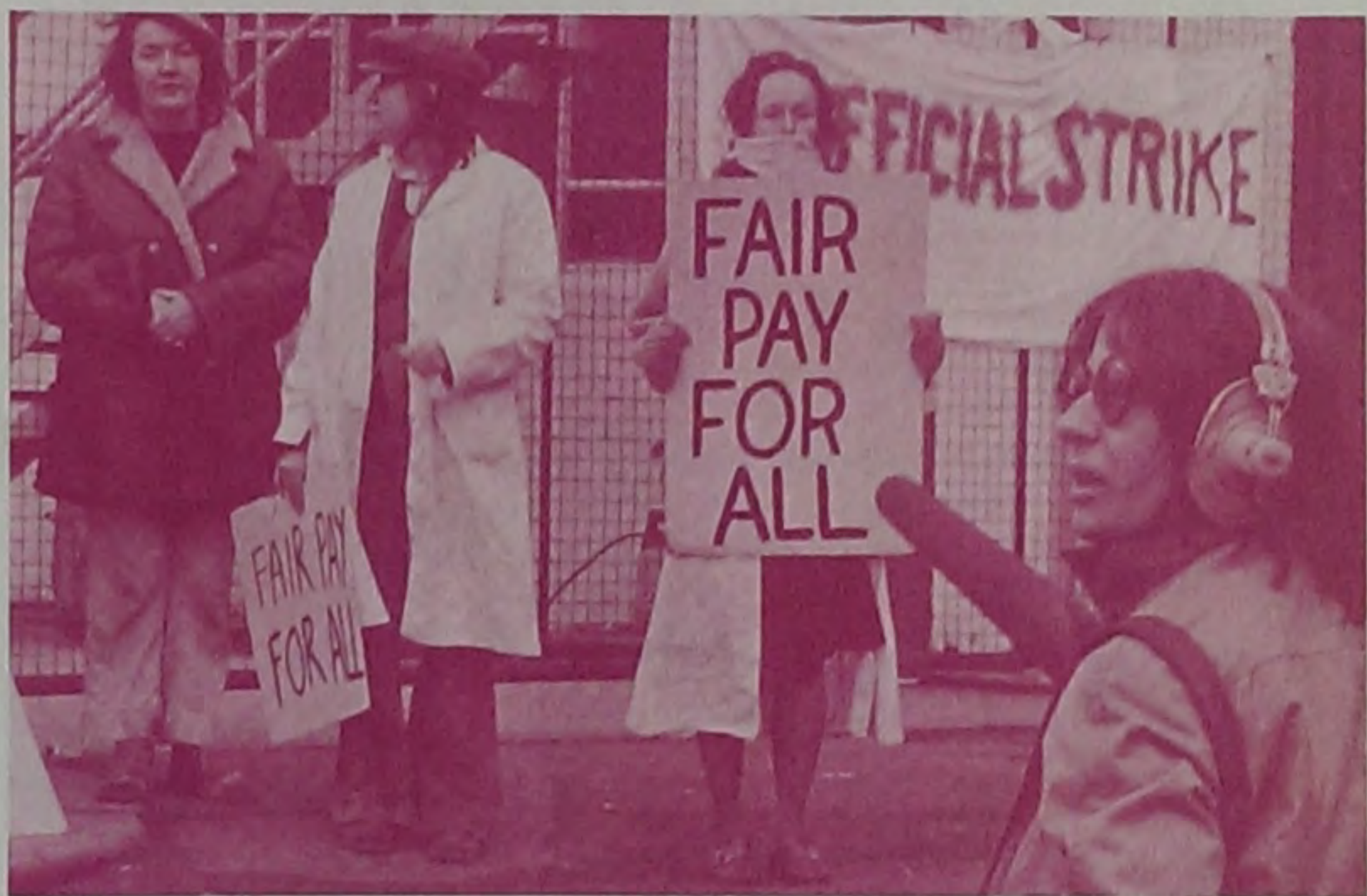
2. Womens Film Group