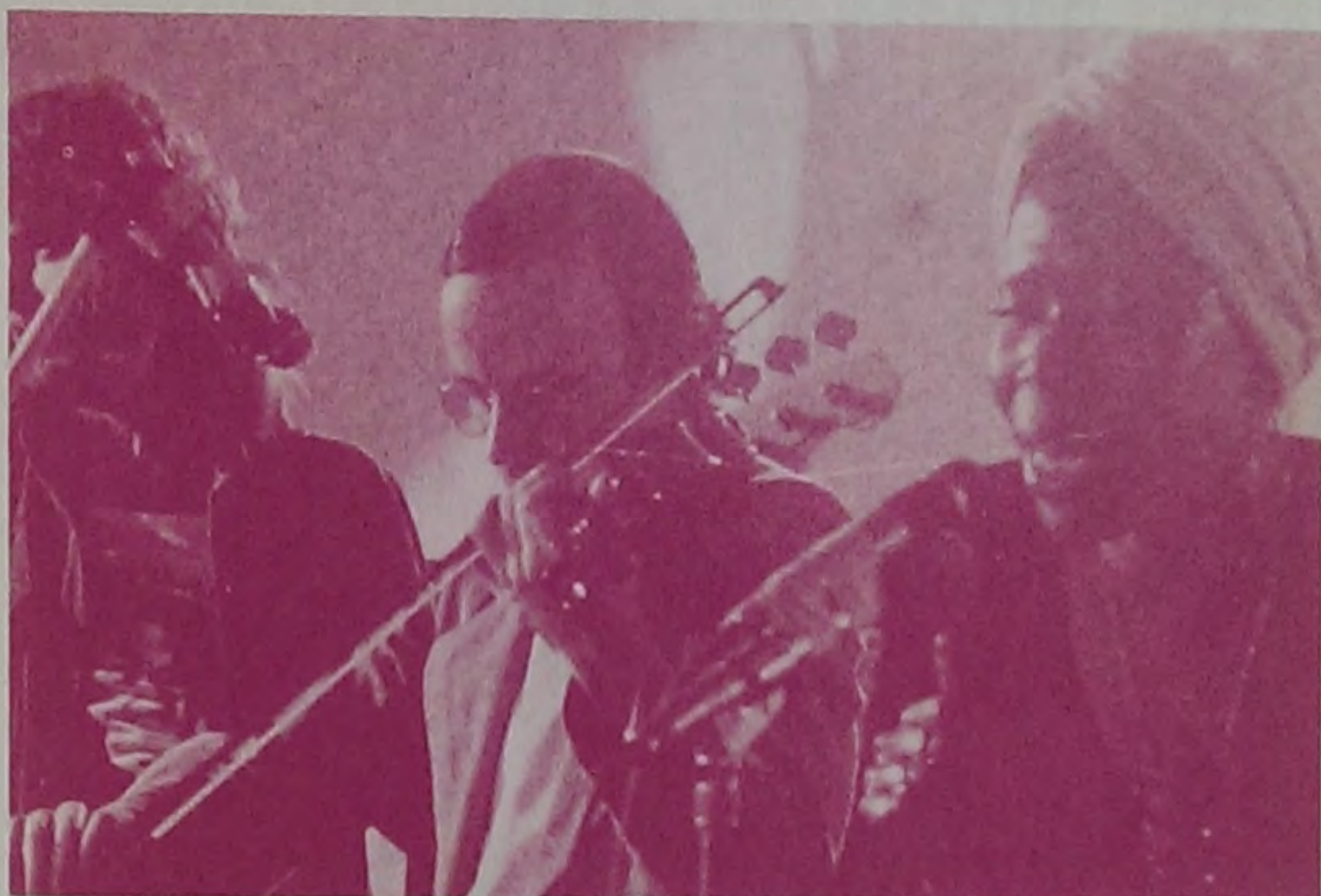
1. Somebody Help Me