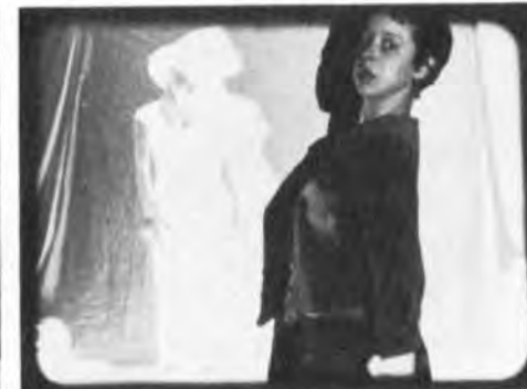
Hands Knees and Boompsa Daisy